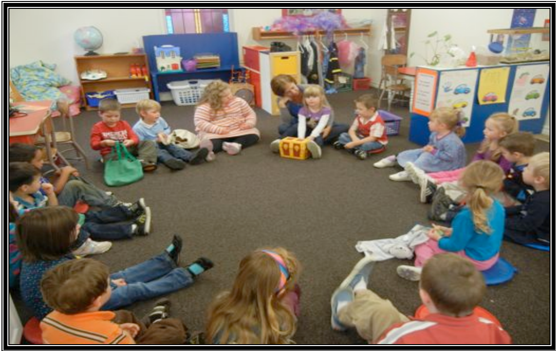
The Rockets class at circle time and at lunch time